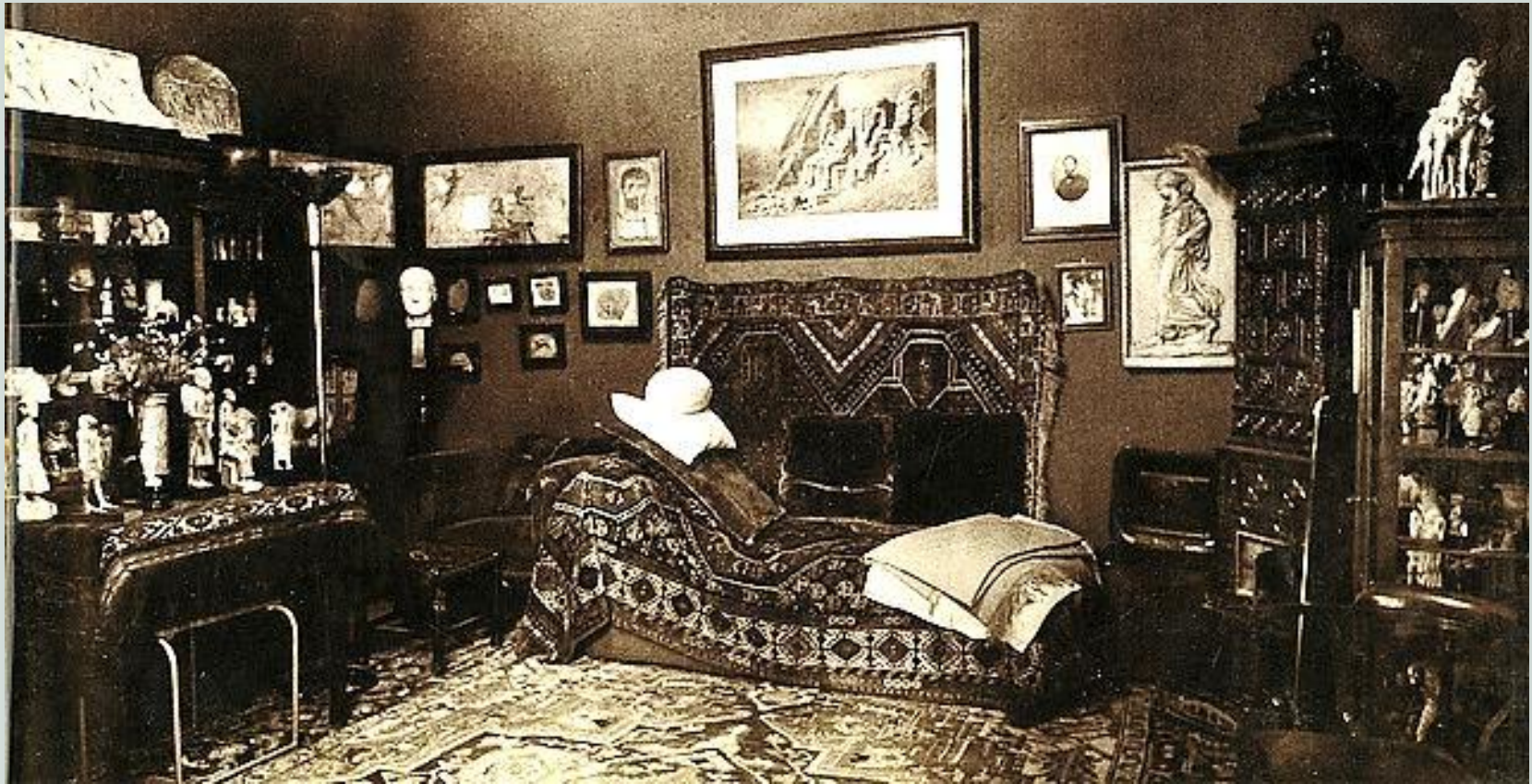
Image: Freud's Office, Berggasse 19, Vienna. From 1938, days before the Freud family left for London.