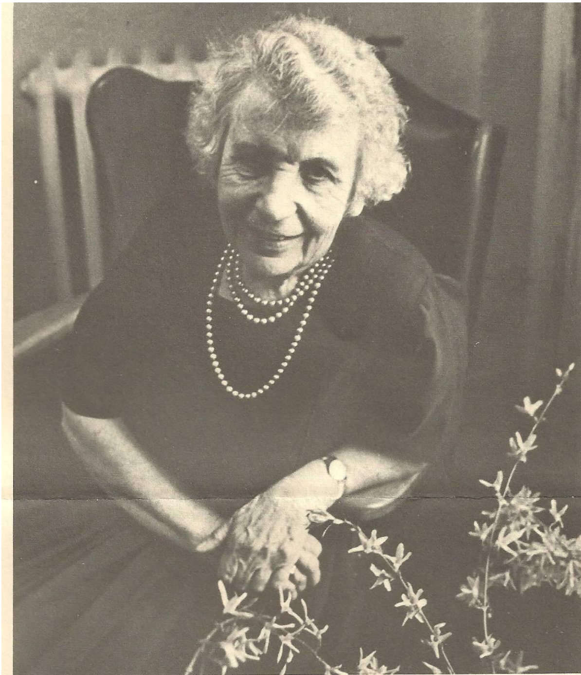
Anna Freud in later years